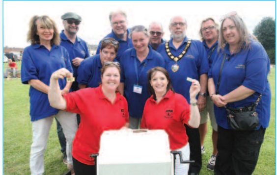
Members of Heybridge Parish Council together with members of the Heybridge Primary School PTFA

Community Festival Save the date for next year - Sunday 30th July 2017!